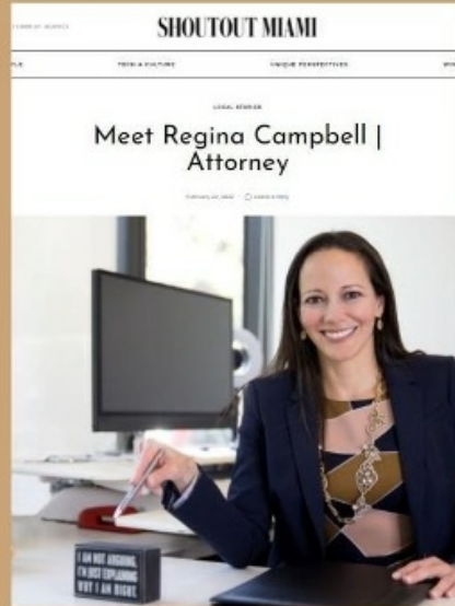
THE CAMPBELL LAW GROUP PA

Our law firm is rather unique in the sense that though we primarily do corporate work (e.g., litigation and transactional work), we've combined a niche area within family law that caters to complex cases that deal with primarily high net worth clients. These high net worth clients require their family law lawyer to have experience in corporate law, as well as family law. Our firm is also unique as I have an entrepreneurial/ business background that adds value to our client's cases and matters.